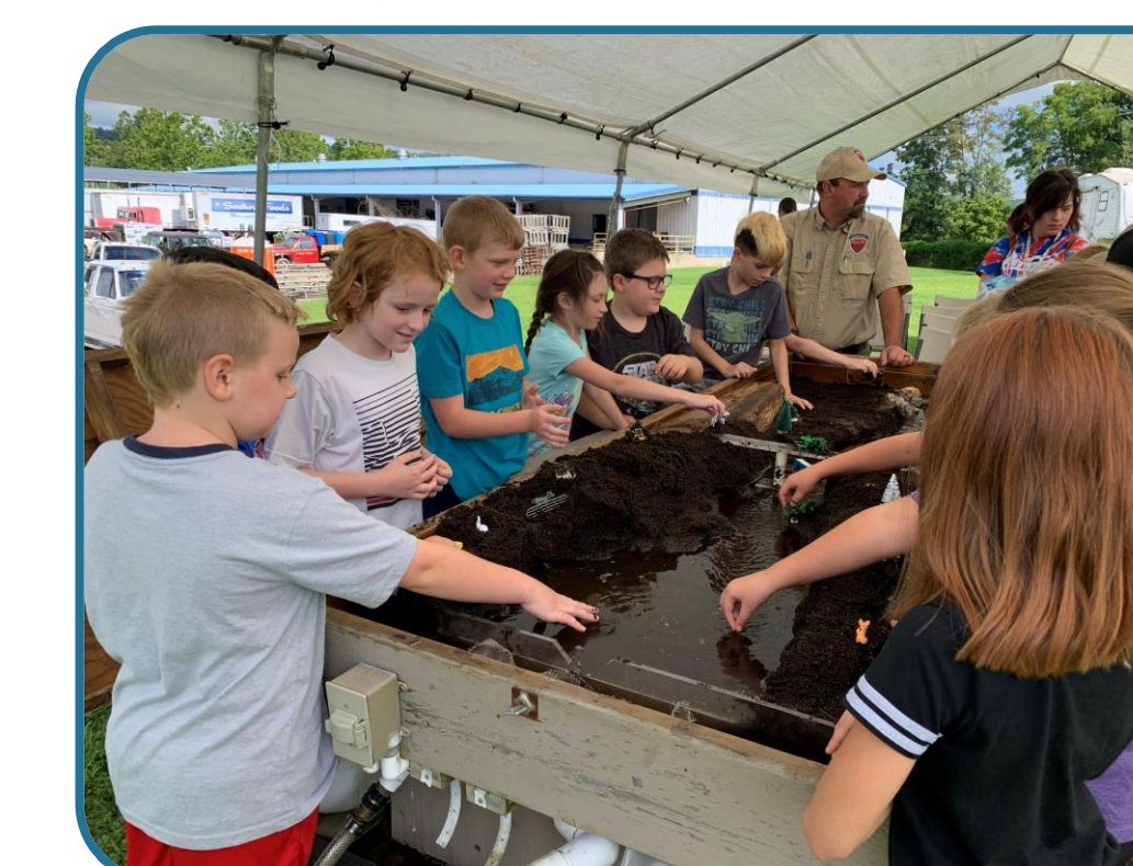
#2: Natural Resources